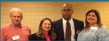
Scientists on the Strategically Focused Research Network on Obesity