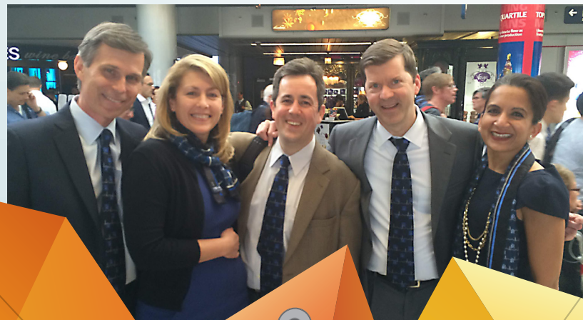
Duke University Center

"AHA is both an advocacy organization — funds research, does public health awareness campaigns — and it has physician members, volunteer members, patients," he said. "It really brings together in one organization a lot of the different stakeholders for cardiovascular health."